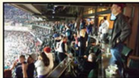
PLC Multipoint Staff