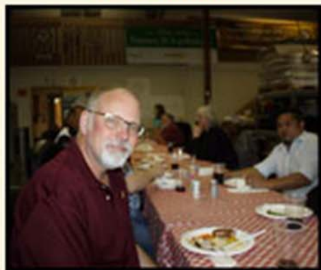
Norm & PLC Family